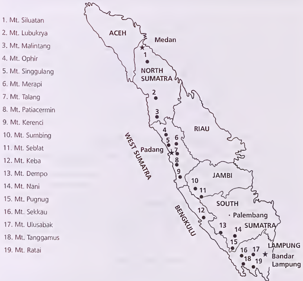
Fig. 3. Exploration sites in Sumatra, Indonesia.

for the common Platycentrum , the distinct impression resulting from observations on Frieda River Begonia was that individual species appeared limited to a single population or to several, with each local population consisting of a few individual plants or small colonies. Over an elevational range of usually several hundred meters along streams, one could observe between four to six different species per stream. Individual streams had different Begonia species compositions, even when streams were adjacent or within close proximity to one another. This Begonia species diversity is the highest Hoover has ever observed in a small geographical area, though similar high-density species diversities among Piper , Anthurium and Philodendron in Carchi and Esmeraldas Provinces, Ecuador were observed. Croat (pers. comm.) has made similar observations for these genera of the Araceae in Western Colombia and Ecuador as well.